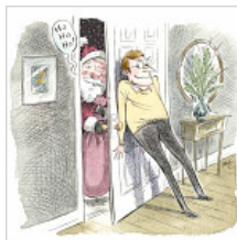
Saying No, No, No to the Ho-Ho-Ho