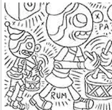
Op-Ed: The Finest Gifts It Brings