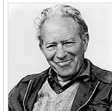
Grandish Wordplay: Harburg's Ish List

Home | World | U.S. | N.Y. / Region | Business | Technology | Science | Health | Sports | Opinion | Arts | Style | Travel | Jobs | Real Estate | Autos | Back to Top